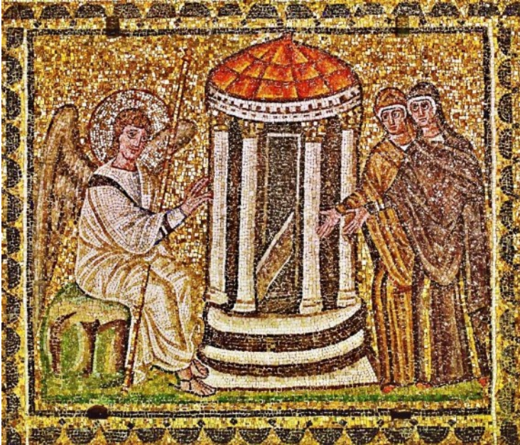
Unknown Artist. The Myrrh-Bearing Women at the Tomb. Basilica di Sant' Apollinare Nuovo. Ravenna (Italy). 6th century

Lighting of the Paschal Candle Renewal of Baptismal Promises Holy Communion