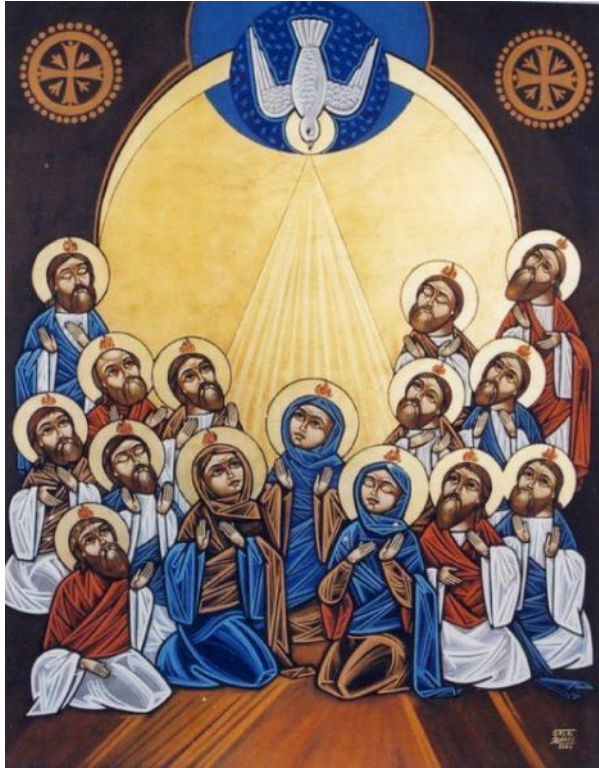
Pentecost Icon—Coptic Christian Tradition