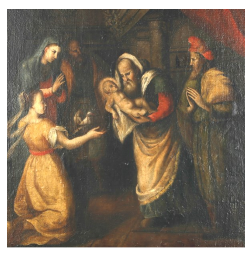
The Presentation of Jesus in the Temple French School, early 17th century