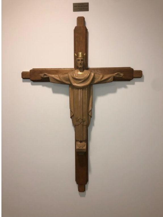
Christus Rex which was formerly at the Community of Christ the King. now at Cathedral College, Wangaratta.